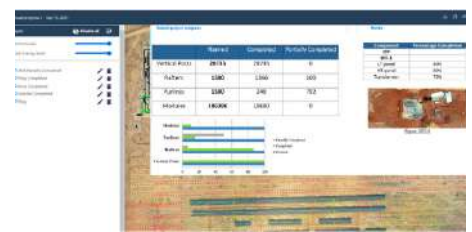
Accurate Progress Tracking