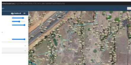
Contour mapping on ortho of Surveyed Land