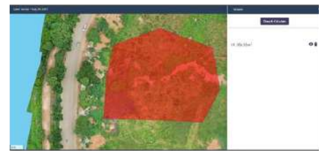
Elevation & Volume Measurement tools